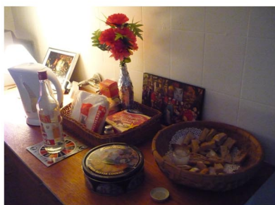
Cabin Fever Installation, 2010 Texts, found objects, photographs, fabric, wood, Dvd player and monitor

Cabin Fever is a reconstruction of the cabin of the Green Cape, where the artists spent 26 days on their journey from Antwerp to Cape Town.